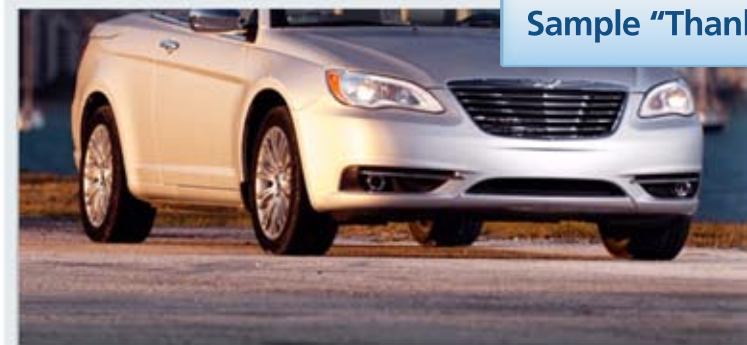
Sample "Thank You" Email