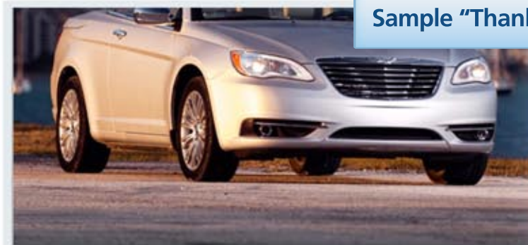
Sample "Thank You" Email